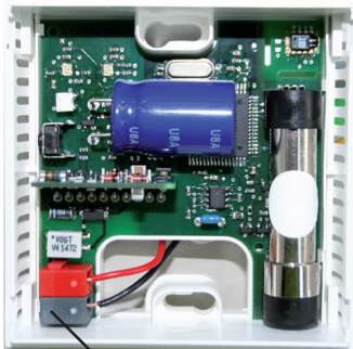
Bus terminal and bus line