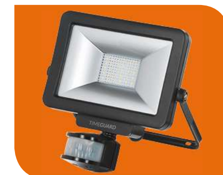
LEDPRO20B Floodlight shown with LEDPROSLB Plug & Play PIR option.