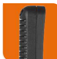
Curved slim design.