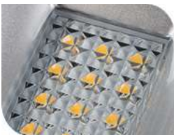
Prismatic LED Lens

The new Night Eye Plus range of LED Floodlights with Plug & Play PIRs and Photocells for instant safety and lighting control