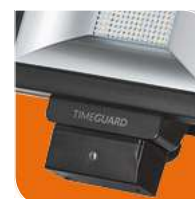
Plug & Play Photocell option with linkable control (sold separately).