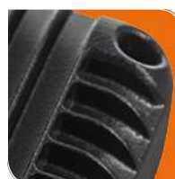
Cooling fins prevent heat build-up for long product life.