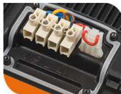
Easy Access Terminals