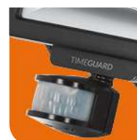
Plug & Play PIR option with linkable control (sold separately).