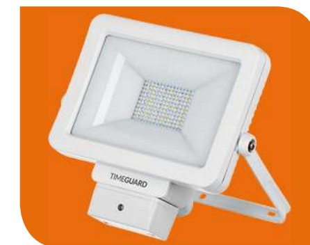
LEDPRO20WH Floodlight shown with LEDPROPCWH Plug & Play Photocell option.

Simply plugs into the terminal box offering a 140W LED PIR and Photocell option. One size fits all floodlights.