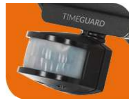
Plug & Play Options (sold separately)