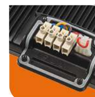
Simple and quick to fit terminal block connection.