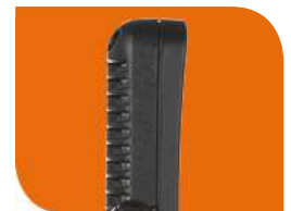
Curved Slim Design