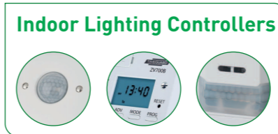
Indoor Lighting Controllers