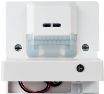
Model: ZV810N (9V Battery Compartment Open)

It's a well-known fact that many households are prone to leaving the light switch on, and these figures add up as an unnecessary cost on your energy bill. Timeguard's range of indoor wall mounted PIR sensors can easily replace the standard wiring of a typical 'traditional' light switch, making it easier than ever to manage the lighting controls in your home. Our model ZV810N will ensure that your lighting is automatically switched off once someone has left the room or detection area. It can also help extend the life of your bulbs and light fittings by reducing the running time of your lighting, meaning replacing your light source less often as well as potentially saving money on your energy bill. To see our extensive range of indoor and outdoor PIR lighting controllers & switches, please click below.