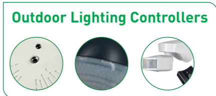
Outdoor Lighting Controllers