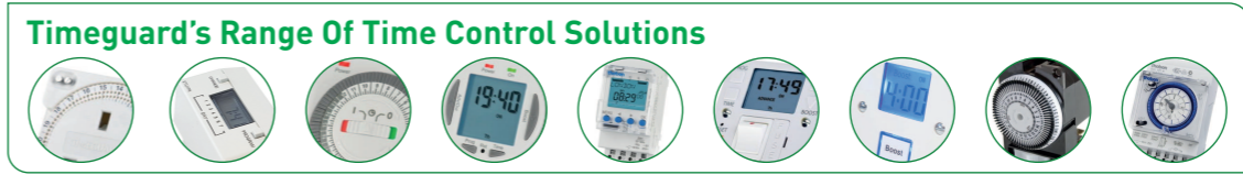
Timeguard's Range Of Time Control Solutions

Leaving large domestic or commercial appliances running quickly eats away at your hard-earned savings and is a positive reason why we believe you should put a lid on expenses when using these heavy-duty power-hungry devices. To help you, Timeguard has a wide range of indoor and outdoor time-control solutions to help you balance the energy output of the appliances you are using. For example, our 'Boostmaster' range comprises both scheduled time controls and time limit controller's which can help you minimise the power output your appliances are using. Our model: "TGBT4N" (4 Hour Electronic Boost Timer), has a maximum 'On' time of 4 hours and a minimum 'On' time of 15 minutes, all at the push of a button, helping to significantly reduce the running time of unused and forgotten about appliances on a day-to-day basis. We also have a considerable range of Plug-In, Din Rail, Surface mount and OEM control options to meet any other requirements you may have. To view our range of time controllers, please click below.